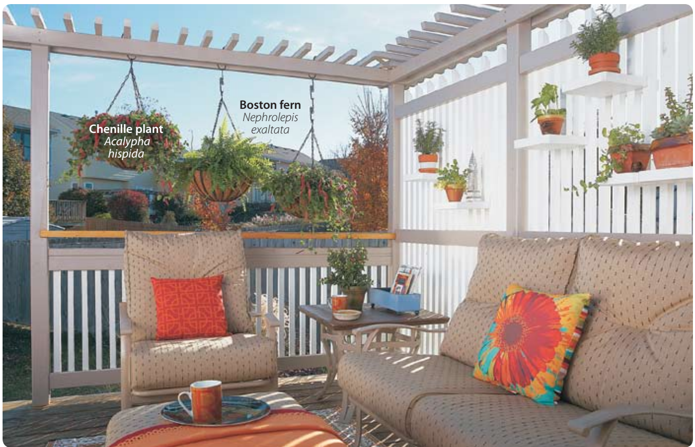
Chenille plant Acalypha hispida